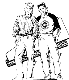
Make a Friend a Squire